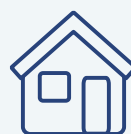
Got symptoms, stay home