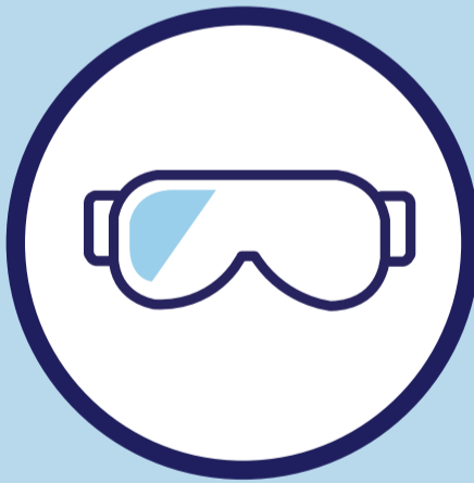
Goggles/ face shield