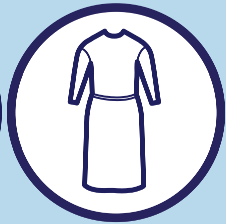
Gown (depending on circumstance)

It may take a few days for the test results to come back.